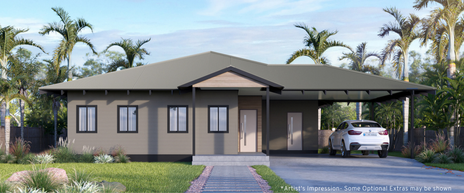
*Artist's Impression- Some Optional Extras may be shown