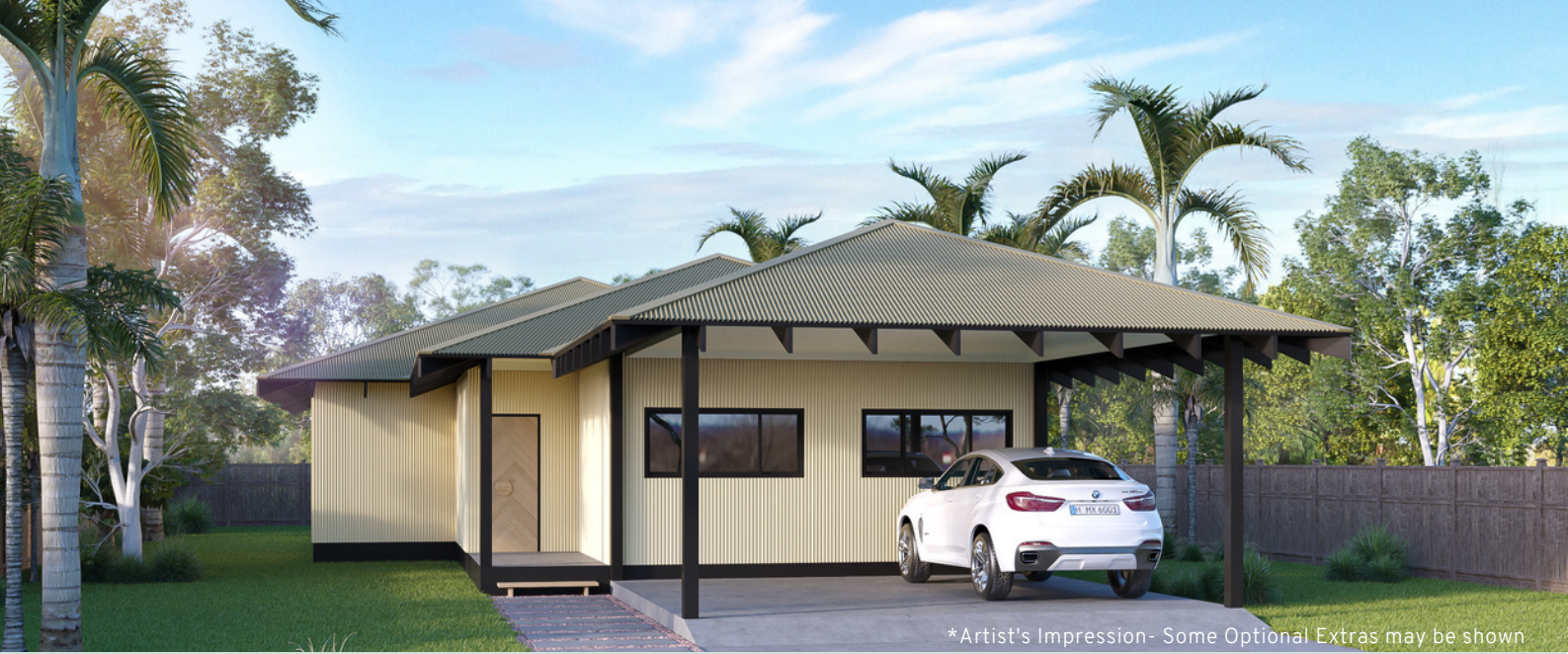
*Artist's Impression - Some Optional Extras may be shown