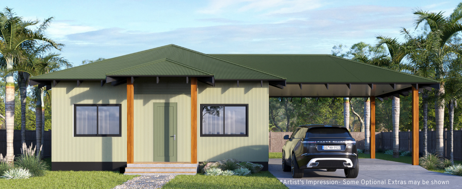
*Artist's Impression - Some Optional Extras may be shown